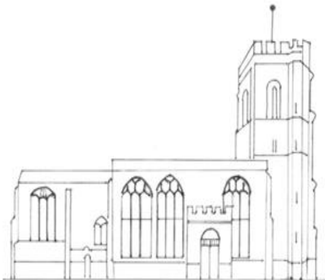
Grade 1 listed St Edmund's Church, Maids Moreton